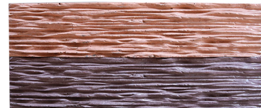
WOODY (10" X 2")