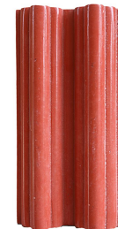
RAJWADI CHANNEL Size: 8" x 4"