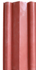
WHITE HOUSE Size: 12" x 6"