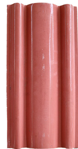
ROUND CHANNEL Size: 12" x 6"