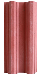
M - CHANNEL Size: 8" x 4"