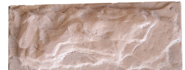
ROCK TILE (10" X 4")